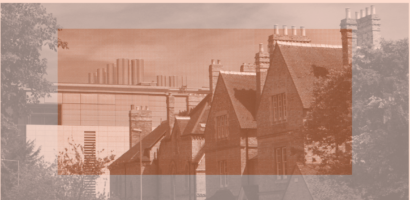
South Parks Road (see 16)