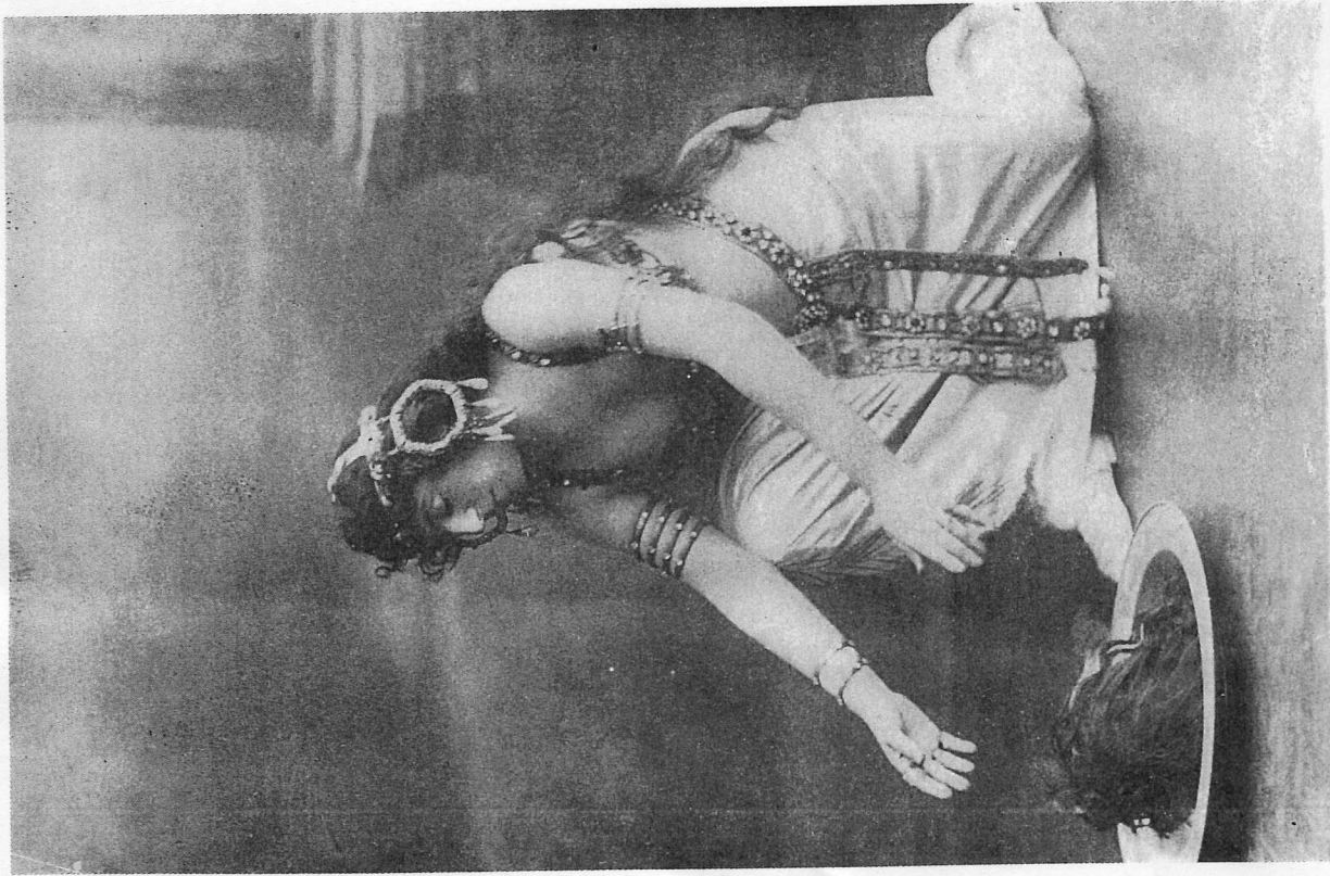
Wilde in costume as Salome